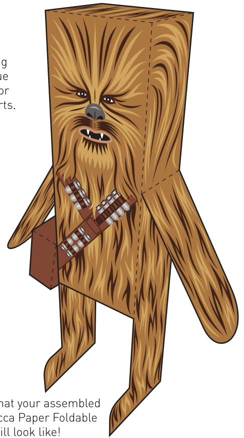
This is what your assembled Chewbacca Paper Foldable will look like!

Print template on cardstock paper. Cut-out along black outlines. Fold on dashed lines. Tape or glue tabs to corresponding sides (double-sided tape or glue stick recommended). Assemble separate parts. May the Force be with you!