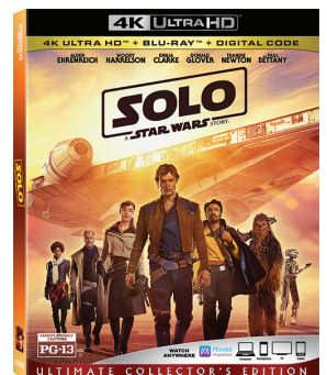
Now Available on Digital and on Blu-ray™ September 25th